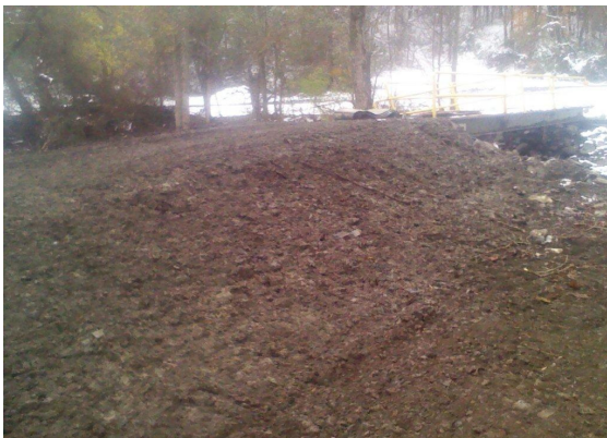
C7B bridge next to the Maple Inn, new ramps in place.