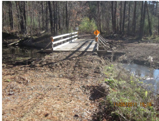
The Rt146 bridge over King's Creek, reset and repaired.