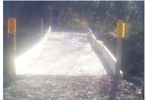
The rebuilt bridge on S70 in East Berne.