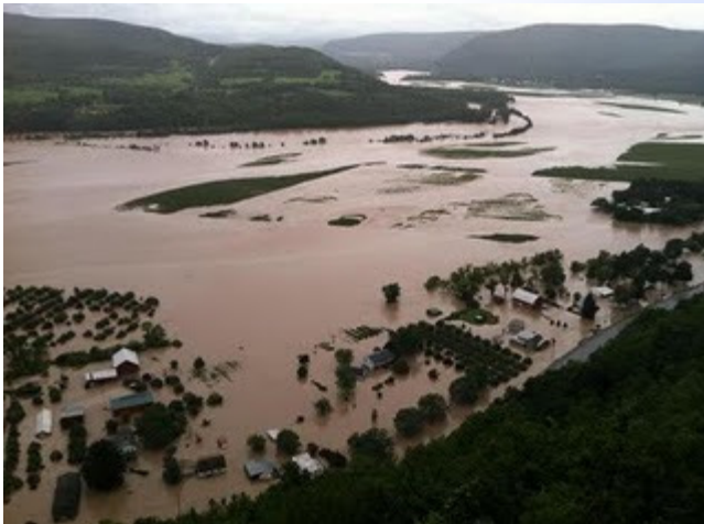
Schoharie Valley, the Monday after Irene visited.

The proposal failed to move to give direct aid to these clubs. Instead extra funding will be given to all clubs who spend dollars beyond current grant totals for the 2011/12 season. The more clubs who spend beyond their grant allocation will mean less funding for all who participate as it is spread further without regard as to whether damage was caused by any storm.