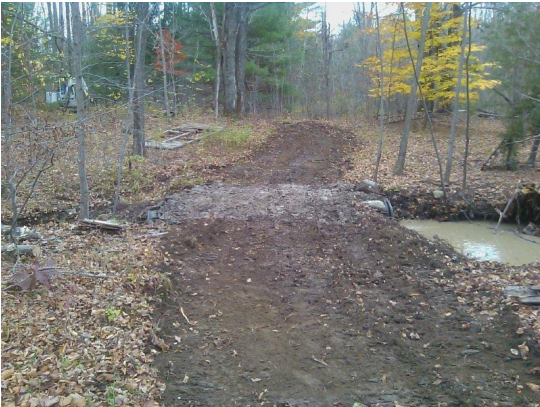
New culvert on C7B south of Westfall Rd and east of Blue Heron Airport.