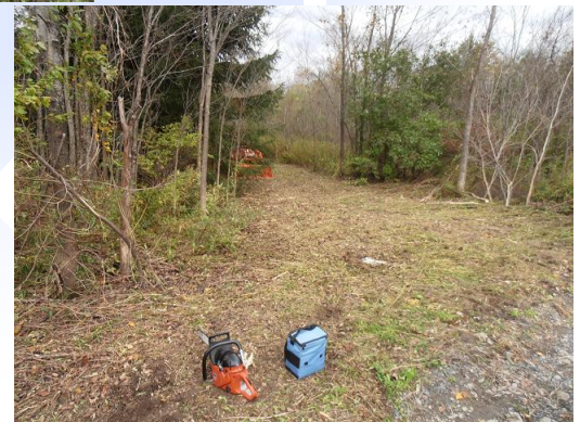
The newly widened C7B at Scott's Printing.